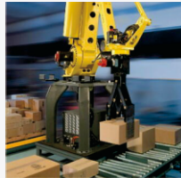
Automation production line