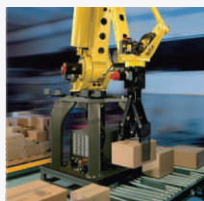
Automation production line