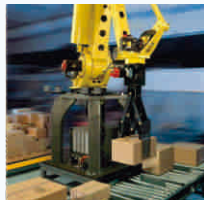
Automation production line