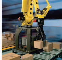
Automation production line