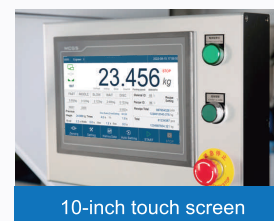
10-inch touch screen

User-friendly interface design, vivid display, easy to operate.