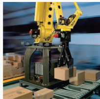
Automation production line