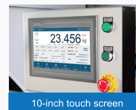
10-inch touch screen

User-friendly interface design, vivid display, easy to operate.