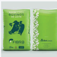
Grain and feeds